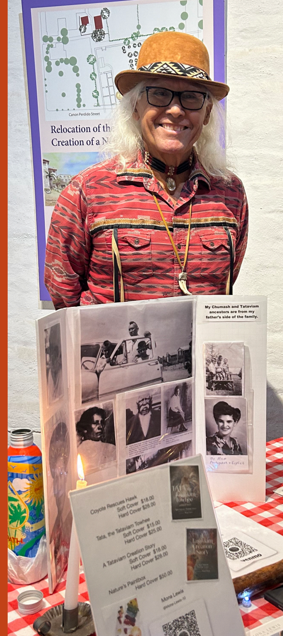
Relocation of the Creation of a N...